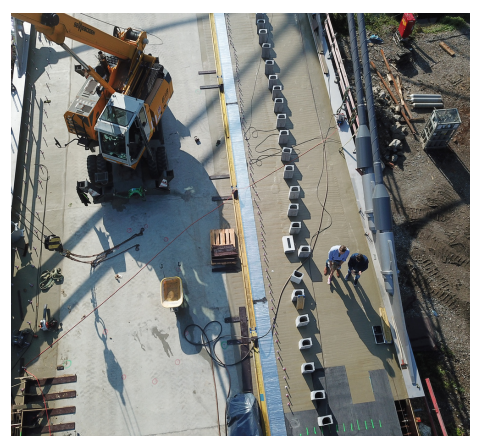
integration drainage into footpath